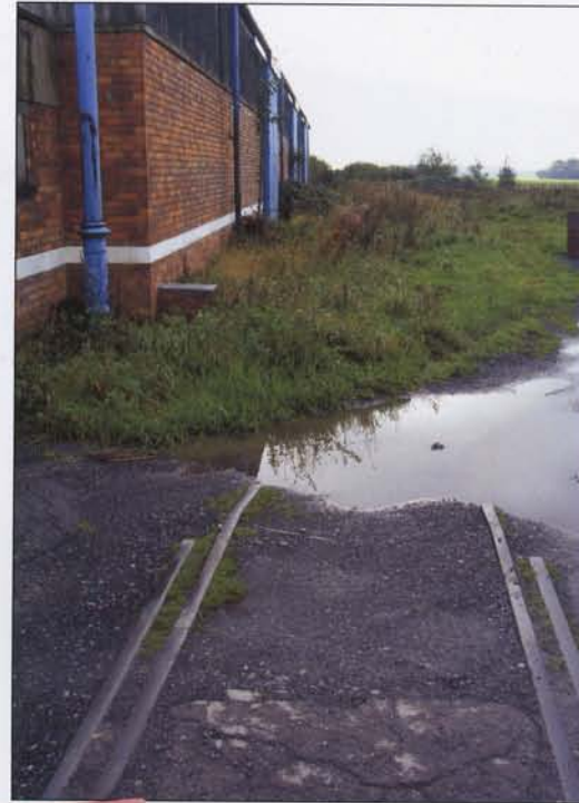
▲ At a warehouse complex near Wheldrake, a short stretch of track survives in the tarmac, a reminder of the line's dependence upon goods traffic.

▼ Skipwith station has been delightfully restored. The two carriages adjoining it are used for holiday letting.