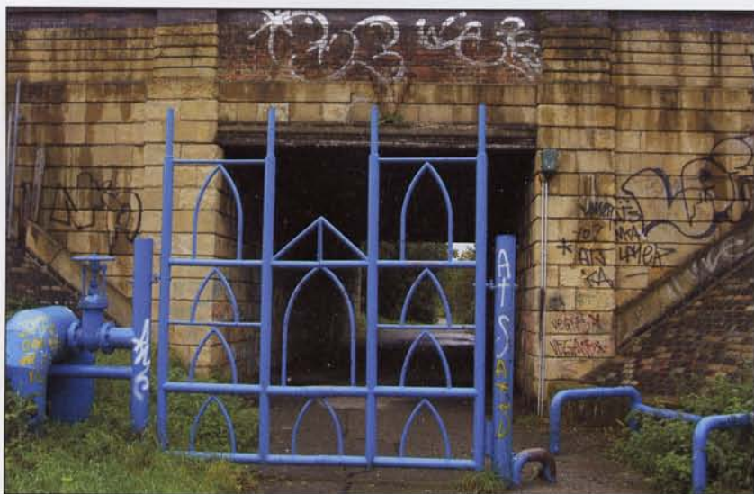
▲ On the outskirts of York, near Tang Hall, an old bridge over the former trackbed has been decorated with sculpture by Sustrans and with graffiti by local residents.

The DVLR managed to escape the Grouping of 1923 and, even more unusually, nationalization, and it never came under the control of British Railways. By then passenger services had long gone, having ceased on 1 September 1926, but there was enough freight (mostly agricultural – hence the DVLR was affectionately known as the Farmers' Line) to keep the railway open, and firmly in private hands, until the 1960s. In World War II it again proved its value as a diversionary route, but more important was its role in transporting bombs to the big RAF Bomber