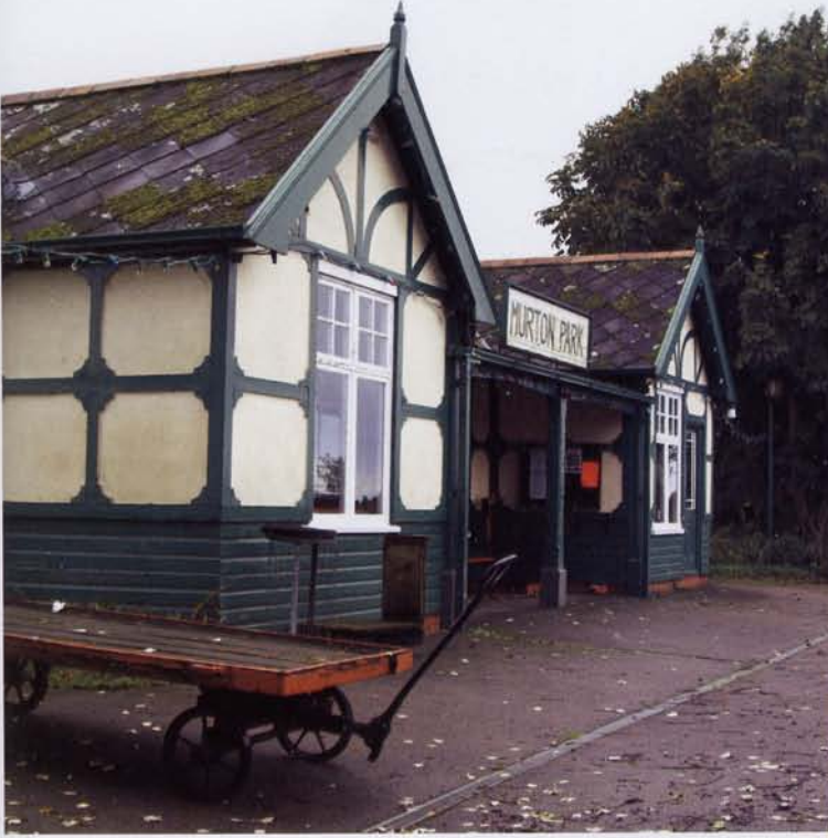
▲ Murton Park station (formerly Wheldrake but rebuilt on its present site) is the headquarters of the Derwent Valley Light Railway preservation society. This shows the characteristic cricket pavilion-cum-bungalow style favoured by the DVLR in 1913 for its stations.

▼ This is the menu and toast list used at a DVLR celebration dinner to mark the coronation of King George V in 1911. The diversity of toasts indicates the general spirit of optimism of that era.