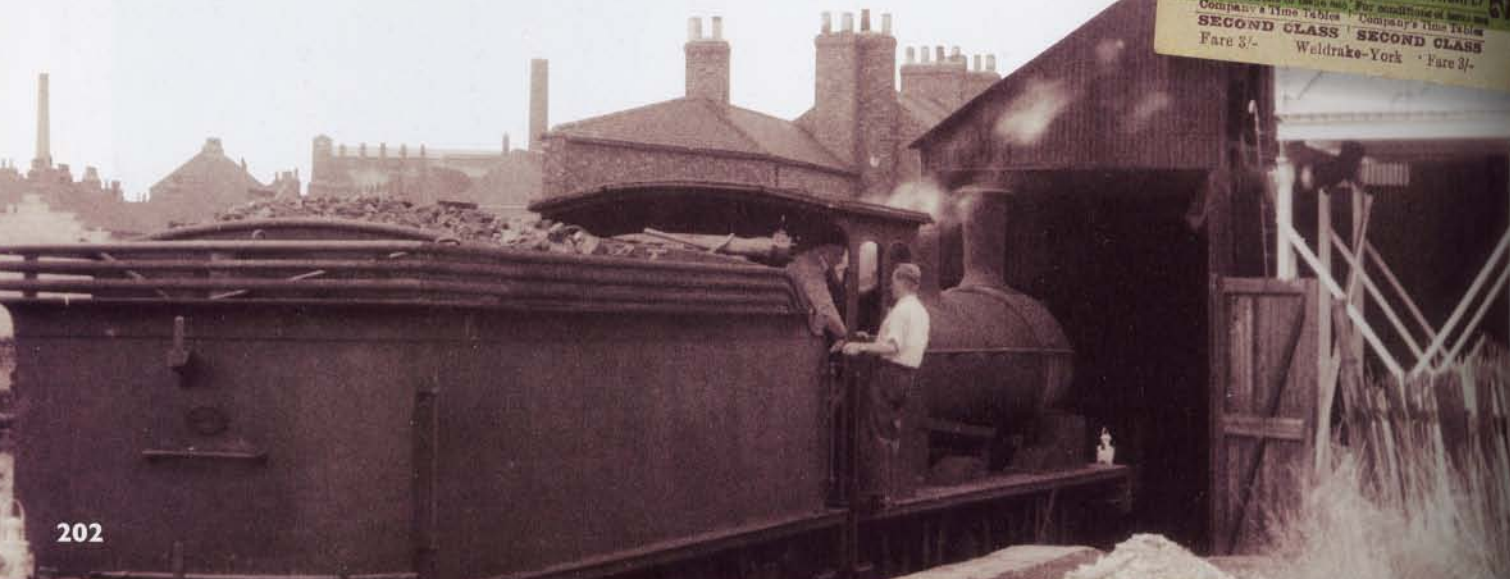
▼ The DVLR shed at York Layerthorpe, a ramshackle affair, was indicative of the somewhat primitive nature of much of the railway.

D. V. L. Bly. D. V. L. Bly. RETURN HALF OUTWARD HALF Available for one journey only valid one month from date of issue Available on day of issue only York L'thorpe TO WHELDEAKE WHELDEAKE TO YORK (L'THORPE) For conditions of issue see Company's Time Tables For conditions of issue see Company's Time Tables SECOND CLASS SECOND CLASS Fare 3/- Weldrake-York Fare 3/-