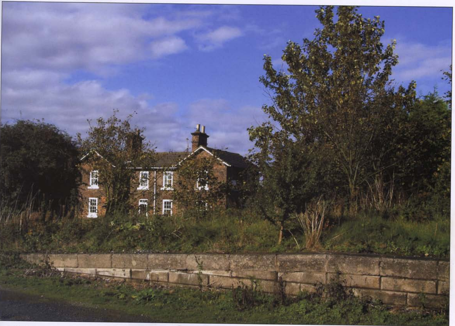
▲ Cliffe Common was the southern end of the DVL, where it met the Selby-to-Hull line. All has gone save the big old station, which is now a private house, and a surviving section of overgrown platform.